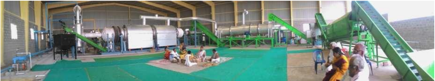
Pyrolysis plant – Plastic waste to oil