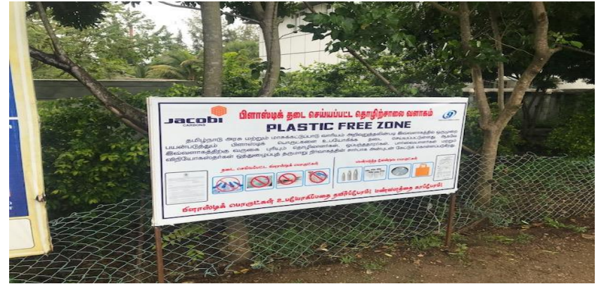
Jacobi Carbons India Private Limited, Coimbatore