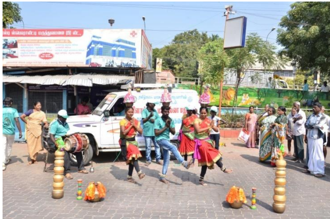
Madurai district – Awareness through Cultural programs