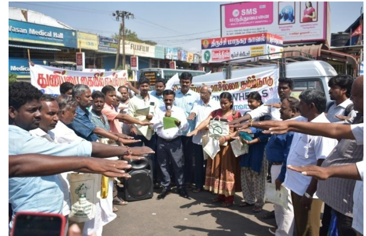
Trichy district – Taking pledge