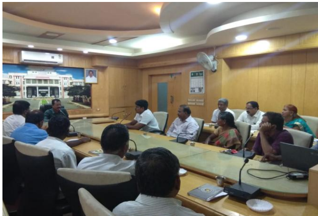
Karur District on 05.12.2018