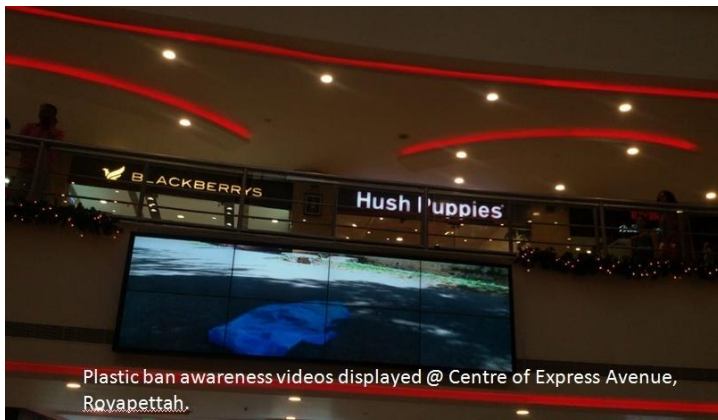
Plastic ban awareness videos displayed @ Centre of Express Avenue, Royapettah.