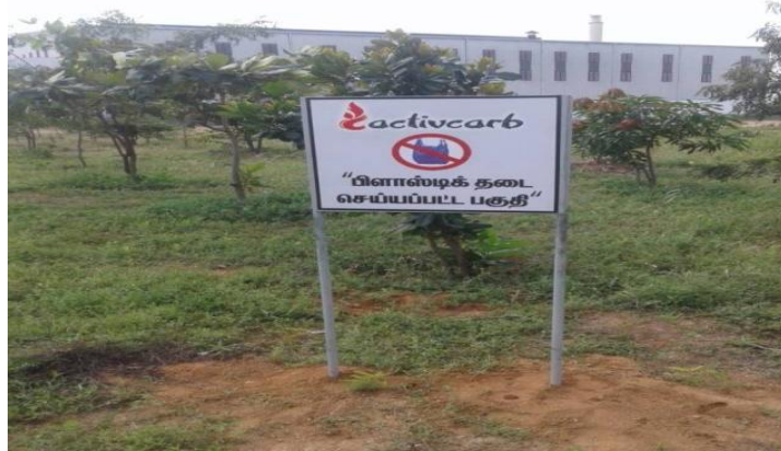
Active Carb, Tiruppur District