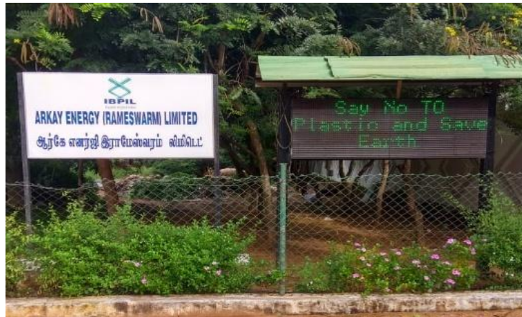
ARKAY Energy (Rameshwaram) Limited, Ramanathapuram District