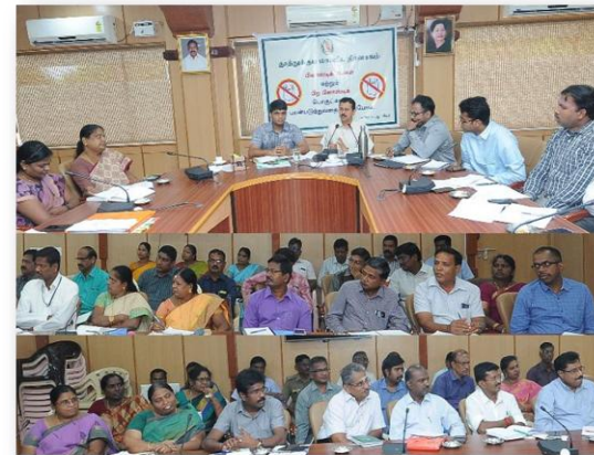
Thootukudi District on 06.12.2018