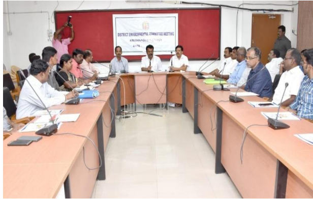
Krishnagiri District on 16.11.2018