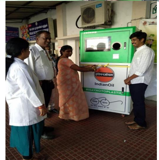
At Secretariat, Chennai