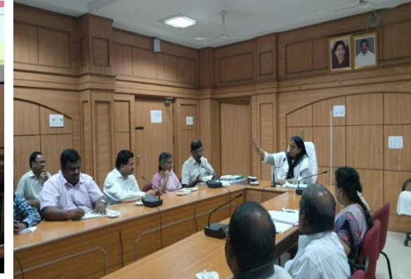
Namakkal District on 20.11.2018