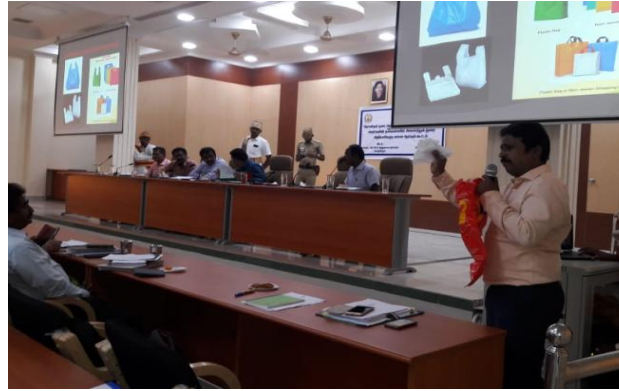
Kancheepuram District on 19.11.2018