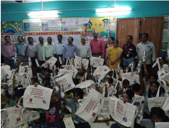
Chennai District – Issue of Cloth bags to school children and cleaning campaign