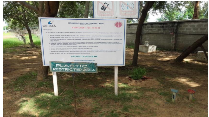
Coromandel Electric Company Limited, Ramanathapuram District